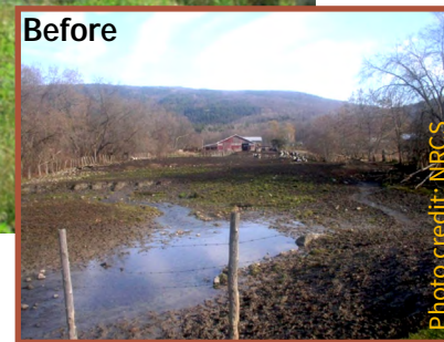
NRCS provides technical and financial assistance to help producers address natural resource concerns, including erosion, water quality, and animal health.