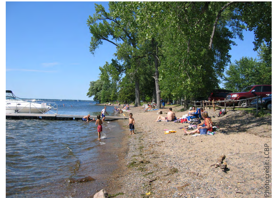
TMDLs—or “pollutions diets”—for phosphorus in Lake Champlain will help to ensure that beaches are closed less often as a result of cyanobacteria blooms.

EPA Region 1 recently completed an update of the Total Maximum Daily Loads (TMDLs) for phosphorus for the 12 Vermont segments of the Lake Champlain watershed. A TMDL is a “pollution diet” that sets the maximum amount of a pollutant that can enter a waterbody and still allow the waterbody to meet water quality standards. This collaborative effort with the State of Vermont included an update to the model used to establish these limits in the Lake and the development of a new model that established limits for inputs of phosphorus and reduction goals for each sub-watershed and land use sector for the entire Basin. The TMDLs include a detailed package of steps the State will take (many stemming from Vermont’s Act 64 of 2015) to achieve reduction goals. The TMDL was issued in June of 2016. EPA is now working closely with the State to track progress towards implementation milestones. EPA Region 2 continues to work with New York State DEC on its implementation plan for the TMDL for the New York portion of the Lake.