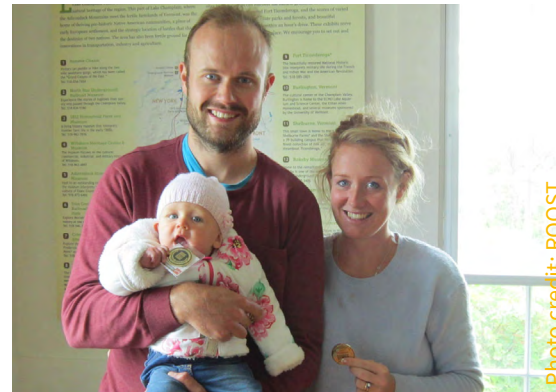
The first Questers—from London, England—reported that search was “a great deal of fun!” after collecting their commemorative coin.

hallmark anniversaries, including the quadricentennial of Samuel de Champlain's 1609 exploration of Lake Champlain, the bicentennial of the War of 1812, the sesquicentennial of the American Civil War, and the 100th anniversary of the establishment of the National Park Service. One recent project—the Lake Champlain Bridge Quest—links the communities of Crown Point, NY and Chimney Point, VT that are the “heart” of the CVNHP. Visitors follow clues on the Quest Map to answer seven riddles about the area's past, and to obtain the quest's treasure: a commemorative coin.