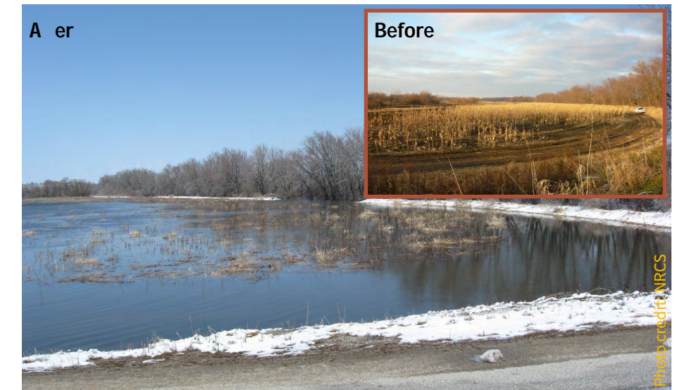
Wetland conservation projects reflect the collaborative approach among partner agencies. NRCS works closely with the U.S. Fish and Wildlife Service (USFWS) to evaluate projects and provide technical assistance for vegetation and hydrologic restoration.

NRCS works with private landowners to protect, restore, and enhance valuable wetland habitat by providing technical and financial assistance directly to landowners through the purchase of wetland reserve easements. Working through the Agricultural Conservation Easement Program (ACEP), eligible landowners can receive assistance to restore and protect wetlands and agricultural land. The voluntary nature of this program allows wetland restoration on working landscapes, providing benefits to farmers and to local communities. In 2016, NRCS in Vermont worked with private landowners to obligate $215,000 through ACEP to purchase wetland reserve easements. Under the Agricultural Land Easement (ALE) component of ACEP, NRCS in Vermont allocated $4 million to enroll nearly 4,000 acres of easements on 32 farms throughout the state.