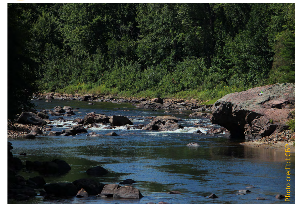
The USGS works with partners to monitor, assess, and conduct targeted research on a wide range of water resources and conditions, including streamflow, groundwater, water quality, and water use and availability.

The USGS conducts a variety of studies using the most advanced scientific techniques that provide water resource managers with effective information for decision making. These studies have evaluated the effects of urban best management practices on water quality and quantity in Englesby Brook in Burlington, VT, the effectiveness of storm-water detention basins at removing contaminants from water, the sources and transport of mercury in the entire Lake Champlain Basin, and high-elevation recreational development influences on the hydrology of streams on Mt. Mansfield. Other projects have mapped flooded lands during high water levels, developed tools for estimating how climate change could influence river flows, and determined long-term changes in water quality indicators for tributaries, such as phosphorus and nitrogen.