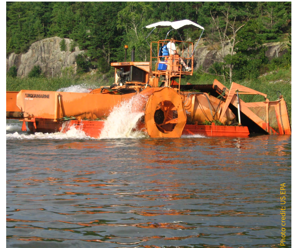
Continued funding from the Army Corps of Engineers has been critical to one of Lake Champlain's success stories in the reduction of water chestnut infestations in the South Lake.

USACE works with state and other federal agencies to control aquatic invasive species that can impair navigation, recreation, and habitat. Invasive plants cost the nation an estimated $250 billion annually. The Aquatic Plant Control Research Program uses the best available science to provide recommendations for effective and economically efficient methods for controlling invasive species. This research helps managers address threats to the Lake ecosystem. The critical funding provided through the program has helped to support successful efforts to control water chestnut in Lake Champlain. This floating invasive plant forms dense leafy mats that impede boat traffic, crowd out native plants, and reduce oxygen available to fish and other aquatic organisms. Mechanical and hand harvesting of water chestnut has helped to reduce substantially the extent of the plant's infestation in the South Lake over the last twenty years.