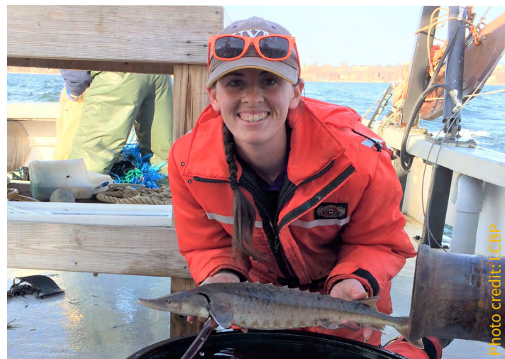
Recent efforts of USGS at the Vermont Cooperative Fish and Wildlife Research Unit are helping to document the status of the lake sturgeon population in Lake Champlain.

The USGS, Vermont and Maine Cooperative Research Units, in collaboration with the Vermont Fish & Wildlife Department, are studying Vermont state-endangered lake sturgeon. While scientists have documented sturgeon spawning successfully, no estimate of the number of adult sturgeon in Lake Champlain currently exists. As part of the project, researchers are investigating the use of two types of sonar—side-scan sonar and dual-frequency identification sonar—to image adult sturgeon. This would allow biologists to estimate population size without handling fish during the spawning run. Additionally, researchers expect to learn more about juvenile sturgeon by using acoustic tags to track their movements in the Lake. Field work for the project began in early 2017, and will continue over the next three years. This work will provide managers with methods for future assessments and enable Vermont Fish & Wildlife Department staff to track progress toward recovery targets.