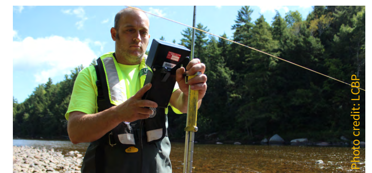
Data collected at Lake and stream gages by USGS staff is critical for long-term research and management of Lake Champlain and its tributaries.

USGS operates 33 streamflow gages and 5 lake level gages that are used to continuously measure the amount and height of water in streams and rivers, and the height of Lake Champlain. The information collected at these gages is posted in near real-time at water.usgs.gov . These data are used for flood warning and forecasting, estimating the amount of nutrients and sediment entering Lake Champlain from tributaries, hydropower operations, drought monitoring and forecasting, hydrologic research, fisheries management, and recreational water activities such as boating. The USGS operates the gages in cooperation with the States of New York and Vermont, numerous local governments, hydropower and dam operators, and the International Joint Commission.