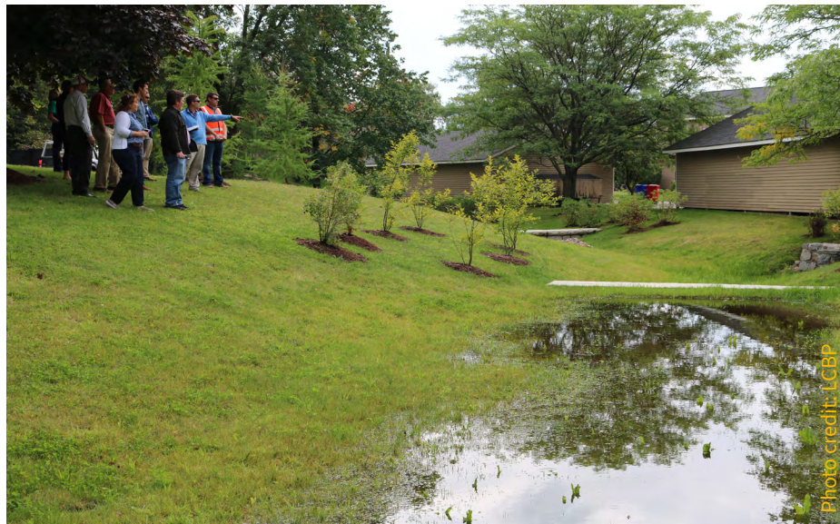
The Bartlett Brook North Stormwater Treatment Project will help to reduce sediment and nutrient loading to Lake Champlain from suburban landscapes with large areas of impervious surfaces.

The USACE works in partnership with the LCBP to implement the Watershed Environmental Assistance Program under Section 542 of the Water Resources Development Act of 2000. The goal of the program is to provide assistance with planning, designing and implementing large scale projects that protect and enhance water quality, water supply, ecosystem integrity and other water related issues within the watershed. The LCBP coordinates the solicitation and review of requests for support from qualifying organizations. The USACE selects projects for implementation, considering the recommendations of the LCBP's Technical Advisory Committee, and provides planning and technical services and project coordination. A recent project with the City of South Burlington, Vermont will reduce the negative impact of stormwater runoff and manage flooding by upgrading failing drainage infrastructure in two suburban neighborhoods. The project constructed drainage swales and grass channels, a bioretention area, infiltration trenches, wetland ponds, and a new drainage system of larger pipes and catch basins.