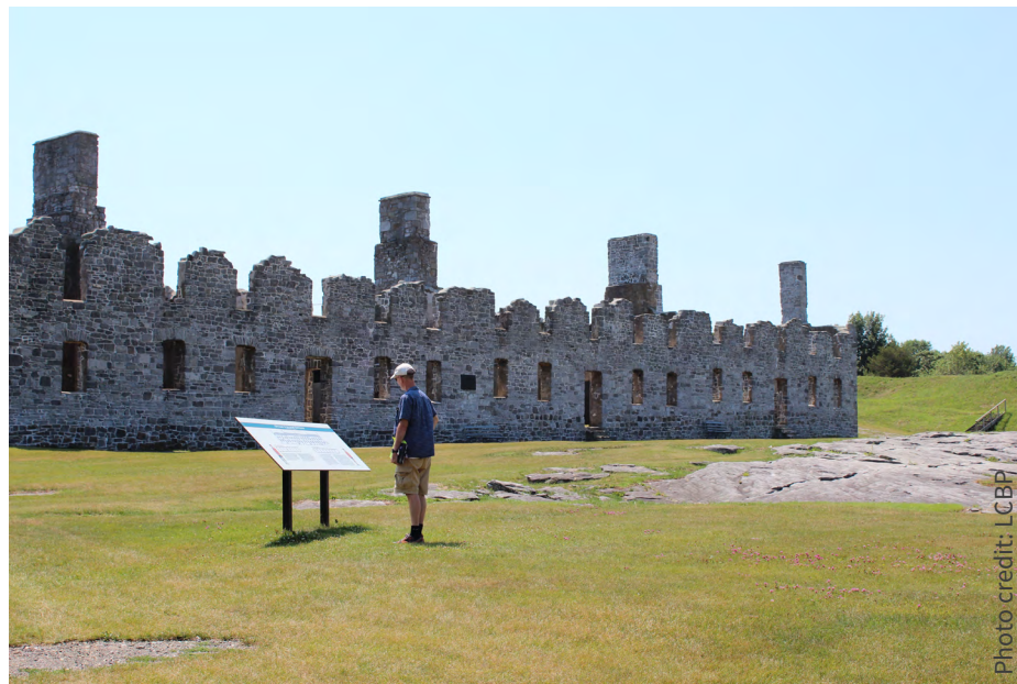
The ruins of the British Fort at Crown Point are at the heart of the CVNHP and a riddle clue in the Lake Champlain Bridge Quest.

The National Park Service fosters local stewardship of the region's natural and cultural heritage, and strengthens sense of place and community pride. NPS provides technical assistance and funding support for efforts in historic preservation, natural resource conservation, recreation, heritage tourism, and education.