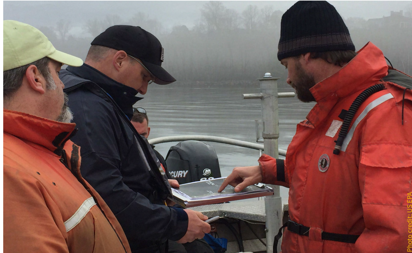
A group of public and private partners has conducted comprehensive surveys of the Lake shoreline to identify vulnerable sites and prepare for potential spills.