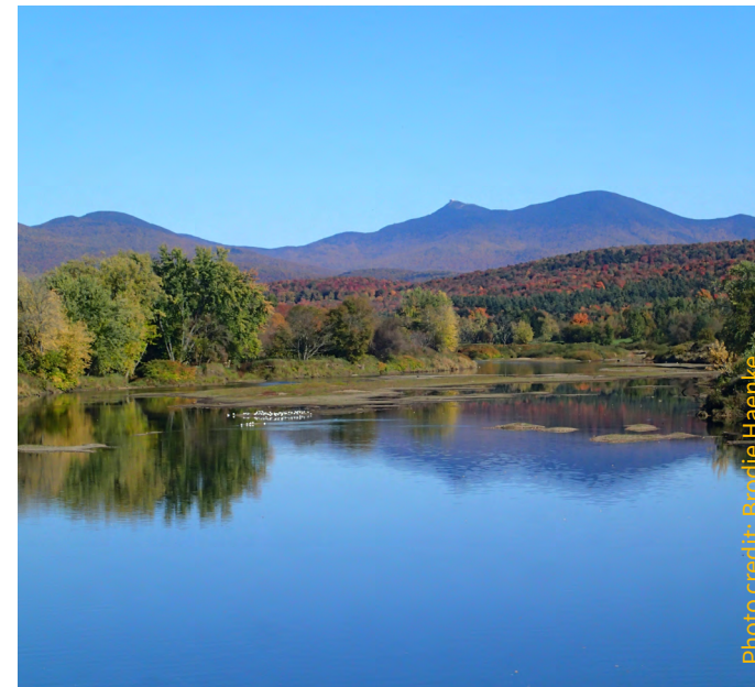
After much consultation between the National Park Service and local communities, the first Wild and Scenic Rivers in the Basin were designated in 2014. NPS offers 54 programs to help communities protect their cultural and natural resources.

The National Park Service fosters local stewardship of the region's natural and cultural heritage, and strengthens sense of place and community pride. NPS provides technical assistance and funding support for efforts in historic preservation, natural resource conservation, recreation, heritage tourism, and education.